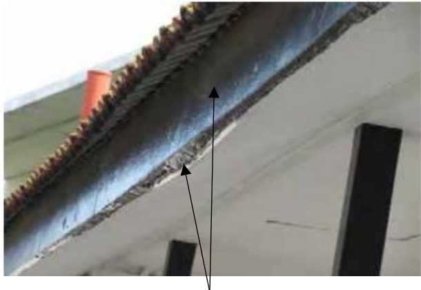
Damaged ceiling board and peeling paint on fascia board