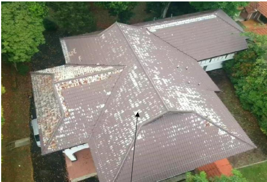
Poor roof condition